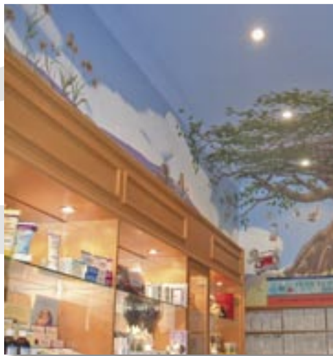
The fantastic new murals at Owen Homoeopathics by local artist Jahne Rees

Bleeding Gums: There is no substitute for regular check ups, scaling, efficient cleaning and flossing in the maintenance of healthy gums and teeth. However some people, despite good oral hygiene have a disproportionate degree of gum disease and/or tooth decay. These people are often helped by a Constitutional prescription from their